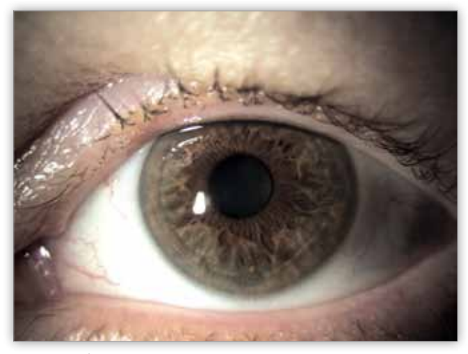
Fig. 2. Left eye 56 years old woman with blepharitis. Ryc. 2. Lewe oko 56-letniej kobiety z zapaleniem brzegów powiek.

Ryc. 1. Przewidywane prawdopodobieństwo zarażenia nużeńcem w zależności od wieku (na podstawie modelu logistycznego).